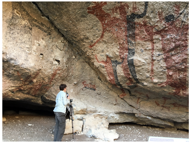
Figure 1 – M. Díaz-Andreu during IR measurements in Cueva Pintata

The Rock Paintings of Sierra de San Francisco encompass an area of almost 1900 km2 in El Vizcaino natural reserve in the northern part of Baja California Sur (Mexico). It includes more than 400 rock art sites where Outstanding Universal Value has been recognized by UNESCO in 1993 (https://whc.unesco.org/en/list/714/). Sites are composed by rock shelters and small caves mainly located along river canyons. Paintings and engravings are remarkably well-preserved because of the dry climate, the inaccessibility of sites and the low population density of the region. The most significant rock art tradition of this area is the so-called Great Mural style (fig.1), which is known since the end of the XIX century (15). The Great Mural rock art composition and size, as well as the precision of the outlines and the variety of colors, make this artistic tradition impressive. The Great