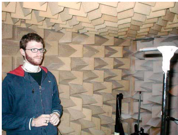
Figure 2 The speaker during the calibration procedure with a throttle-activated microphone and a classical one in front of him.

Because of the big discrepancy between the frequency response of the two tracks, we have calculated an equalization filter simply making the dB-difference of the two average spectrums (when speaking at normal loudness) on the entire sentence from 80 Hz to 5kHz.